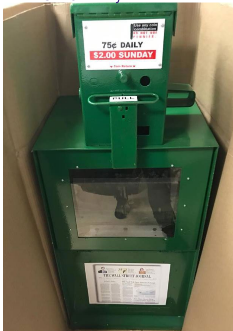
Our January Pic Pick

A group of SFTA staff members have been working over the past several months to set up a Little Free Pantry on our office property, to provide community members with easily accessible basic needs items including food, toiletries and diapers. We are excited to upcycle, decorate and install the newspaper holder above and unveil our pantry in the next few months. Stay tuned, and meanwhile learn more about the Little Free Pantry here.